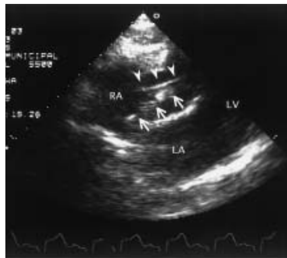
Fig. 2 Postoperative echocardiogram in the sub-xiphoid view

The patient has suffered no events since discharge. Repeated assessment 5 months after showed the intraatrial P wave potential was 0.35 to 0.50 mV in all postures. During 5 months, the total number of paced ventricular beats was 13 million,