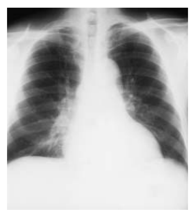
Fig. 1 Chest radiograph on admission

Chest radiography revealed cardiomegaly( cardiothoracic ratio = 56% )with mild pulmonary congestion(Fig. 1). Electrocardiography showed R wave retraction in leads 3 - 4, biphasic T wave in leads 2- 5 and ST segment depression in leads and 5-6 (Fig. 2). Abdominal computed tomography showed hepatosplenomegaly with mild ascites. The conduction velocities of the median nerve and tibian nerve were decreased. Bone scintigraphy showed no osteolytic or osteoclastic lesion. Bone marrow puncture showed mild plasmacytosis without plasmacytoma. Lumbar puncture was not performed. Echocardiography showed left ventricular hypertrophy and dilation with normal contractility(interventricular septal thickness, left ventricular posterior wall thickness, left ventricular end-diastolic diameter, left ventricular end-systolic diameter and ejection fraction were 14, 12, 65, 40 mm and 68% respectively ). The left atrium and aortic root were slightly dilated and mild pericar-