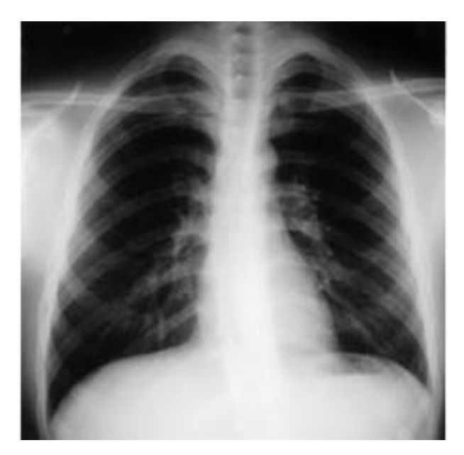
Fig. 2 Chest radiograph showing clear lung fields, and a cardiothoracic ratio of 33%

farin, 4 mg/day )was added to the antiplatelet therapy( aspirin, 0.4 g/day), and the patient was scheduled for outpatient follow-up.